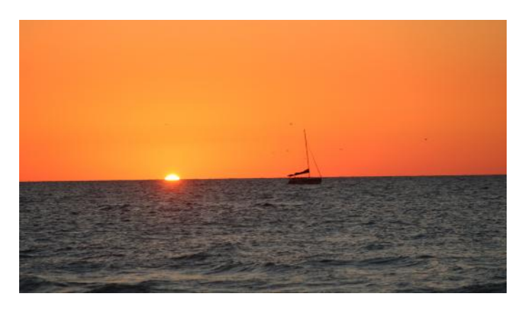
Evening out the colors of the day; A time of transition - a softening vision Fills the eye and the spirit with gentleness. Earth and Heavens merge and blend; The setting sun leaves traces of the day. Anticipation of night and new sights Offers a shelter of darkness. A night sky, dark, yet overflowing With stellar sparkling grandeur, Reveals a glory of creation That sings of hope and beauty in all.