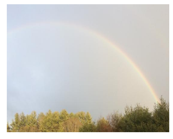
A promise, a challenge; storms will pass, Leaving new beauties behind. Arced in glorious splendor, brightening still; Gracing the eye and soul with hope. A pause given for rest and renewal, Inspiring healing and wonder for the spirit.