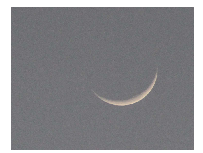
The end-winter new moon smiles down; Faithfully following appointed rounds; A vision of harmony in the heavens above; Growing to fullness welcomes in spring.