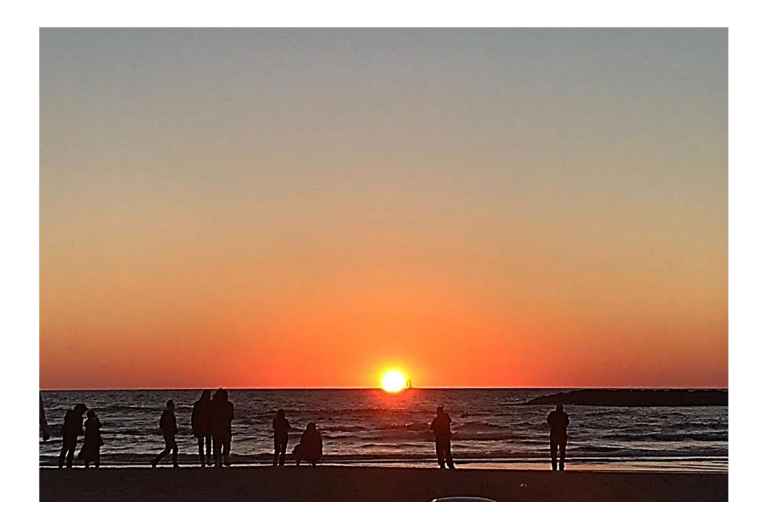
Spring forward, fall back – the sun does not know; Day cycles into night in their set pattern; Marking time is in human perception; Lose an hour, gain an hour – the world goes on; The challenge is how to use the time well.