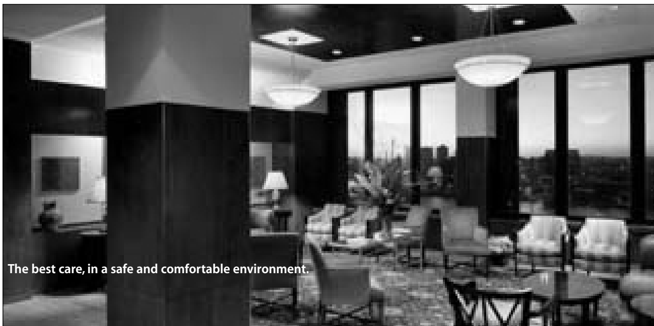
The best care, in a safe and comfortable environment.

Trusting your care to the world-renowned surgeons of the Massachusetts Eye and Ear Infirmiry