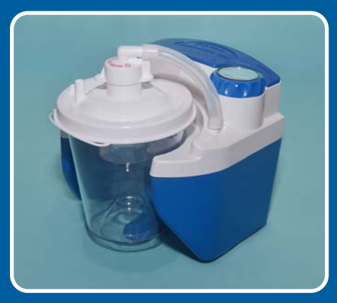
Portable Suction Machine