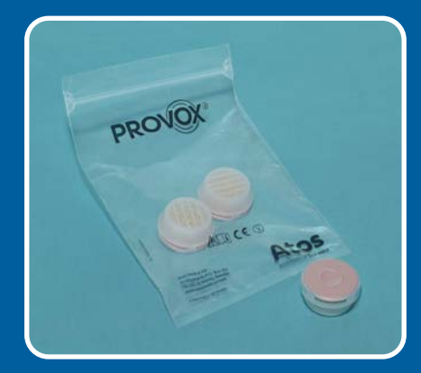
Heat Moisture Exchanger (HME)